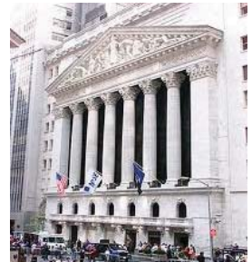
The New York Stock Exchange