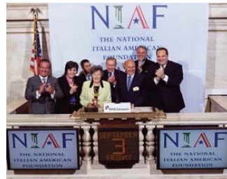
NIAF's Leadership at the podium at the New York Stock Exchange.