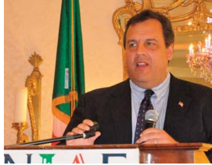
Governor Chris Christie addressing the audience